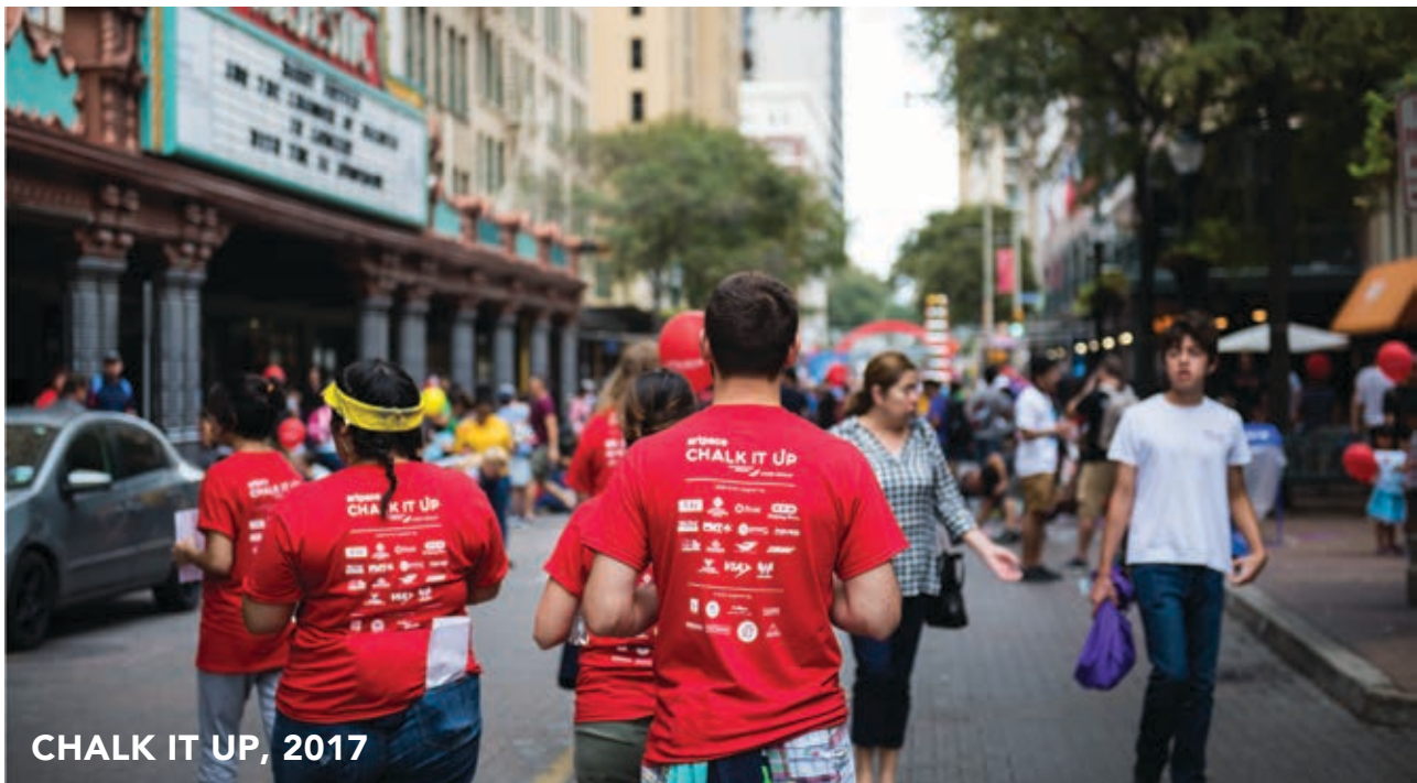
CHALK IT UP, 2017

In 2017, Chalk It Up was named "Best Downtown Event" at the 2017 Centropolitan Awards. This year's Chalk It Up features an exciting new footprint which extends along the freshly redesigned Main Avenue. All support received for this free, family event will ensure the sustainability of Artpace's public programs and the Artpace Teen Council. We hope you will join us as a sponsor during this once-a-year opportunity.