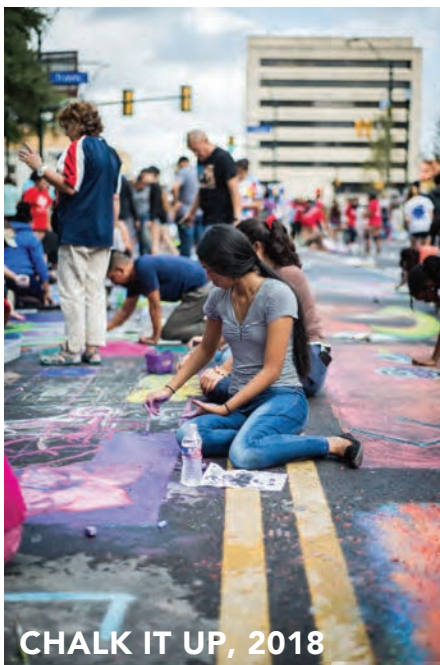
CHALK IT UP, 2018

Artpace Chalk It Up is considered San Antonio's "Best Downtown Event," according to the 2017 Centropolitan Awards. Last year, we proudly unveiled a new festival footprint, which extends along redesigned Main Avenue and up Houston Street providing seven city blocks of sidewalk canvas. We also piloted a special VIP rooftop lounge where sponsors, supporters, and artists can enjoy a birds-eye view of the festival while convening over food, drinks, and music. In addition to funding this free, family event, the support received allows Artpace to serve the community year-round through admission-free programs, exhibitions, and residencies. We hope you will join us as a sponsor during this once-a-year opportunity!