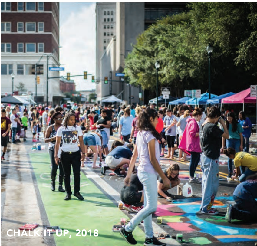
CHALK IT UP, 2018

Artpace is a nonprofit residency program which supports regional, national, and international artists in the creation of new art. As a catalyst for artistic expression, we engage local communities with global art practices and experiences. Since 1995, Artpace has welcomed more than 270 artists and curators from around the world through our International Artist-in-Residence program. This program connects artists to unparalleled resources and allows audiences to engage with the most innovative art and artists in the world.