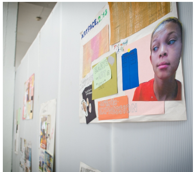
Above: Student examples of newspaper project.

Artpace San Antonio 445 North Main Avenue San Antonio, Texas 78205-1441 210.212.4900