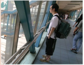
Above, Left: http://pakpark.blogspot.com/search/label/5.%20Newspaper%20Projects , 2012. Above, Right: http://pakpark.blogspot.com/search/label/5.%20Newspaper%20Projects , 2012. Photos by Mingpao Newspaper.